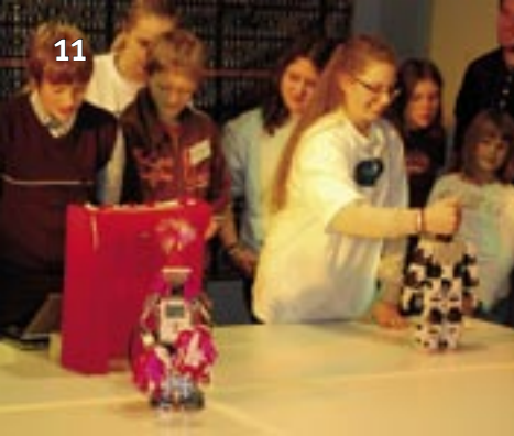
Robots bring dreams to life!