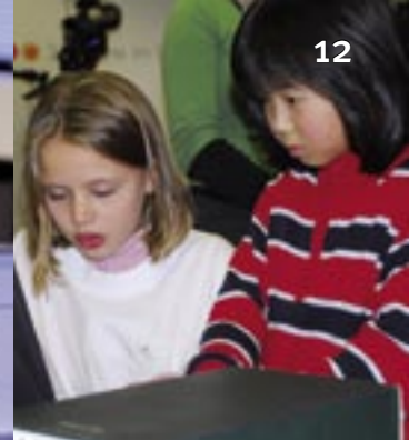
The phenomena of day-to-day life shall be explored